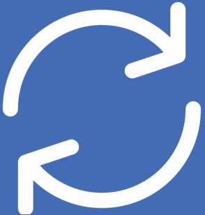
Updates and upgrades