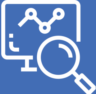
Daily system checks & backups