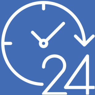
Out of hours cover