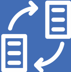
Monthly database copies